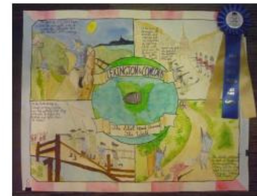
The Americanism Poster Contest

"The objects of this Society are declared to be patriotic, historical, and educational...." -Constitution of the SAR Article II